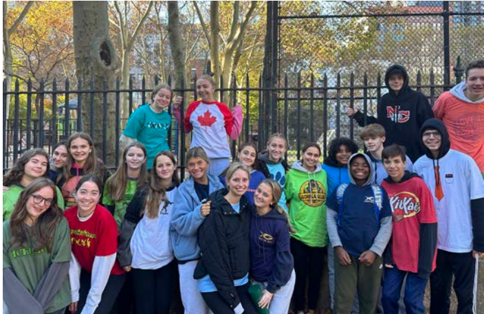
Senior Freshman Retreat

We had such a wonderful previous month as a collective youth group between our various service projects, fellowship hours, and craft nights. We created boxes for our alumni high school fish in college, planted some fall-themed herbs, and of course carved and decorated pumpkins for Halloween. We worshipped together in our Gratitude Youth Worship and served our community in various ways, from creating cards and soup for those in need to heading into Manhattan to serve those currently without a home. Check out our YG seniors and freshman smiling outside our breakfast run location in New York City!