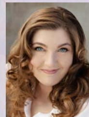
Greer Lyle soprano