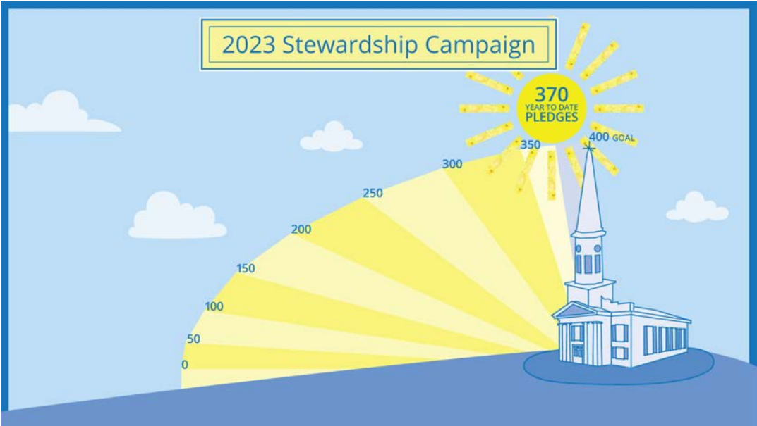
Currently, we are at 370 pledge cards (93% of goal).

Our 2023 Stewardship Campaign is making positive strides toward our goal, though we still have a ways to go. This Stewardship season, we are focused on Jesus' call in the Sermon on the Mount to be light to the world and to allow God's light to be reflected in our living and giving. We ask that you consider how our community of faith has brightened and enlightened your lives and that you support our church by pledging to the very best of your ability. Currently, we are at 370 pledge cards (93% of the goal). We are very grateful for the blessings of this community. If you have not yet pledged, please consider making a pledge to the Stewardship Campaign.