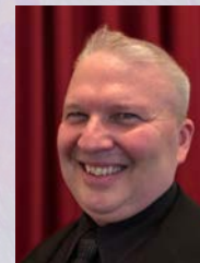
Aram Tchobanian tenor