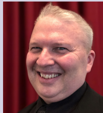
Aram Tchobanian, tenor