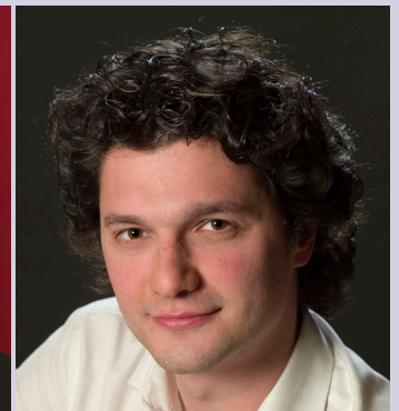
Dimitrie Lazich, baritone