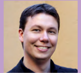
Composer Ola Gjeilo

If you would like to sing with the Chancel Choir but have limited time, consider singing during the Lenten season and on Easter Day. The Chancel Choir will sing Lenten anthems beginning Ash Wednesday, February 14 and Sundays beginning February 18.